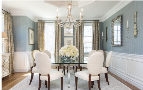
High-End Furniture $75/Per Month